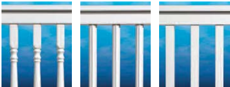
COLONIAL FLUTED SQUARE